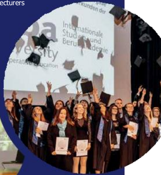
After passing the exam