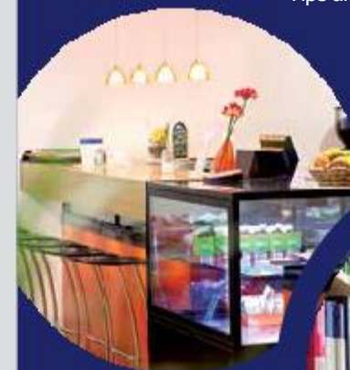
The cafeteria coffee lounge