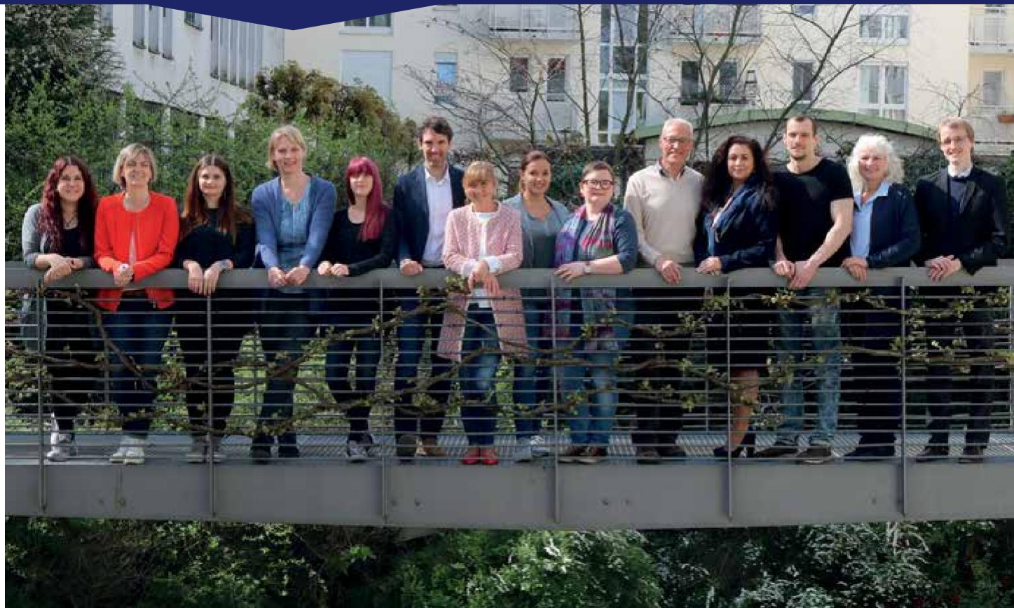
The team of the ISBA Freiburg Campus