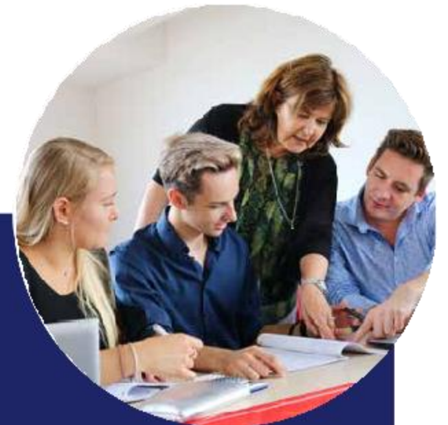
Studying in modern rooms