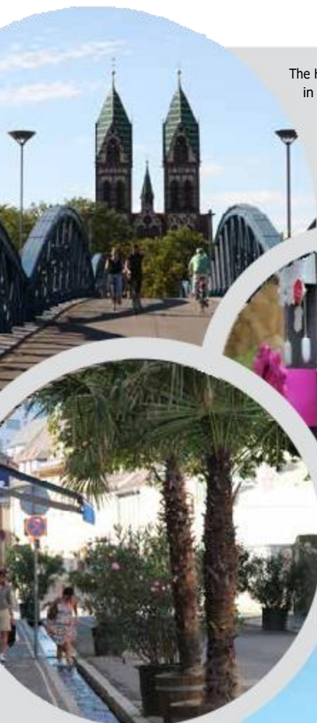
The Herz-Jesu-Kirche in the Stühlinger

In Freiburg, one of the most attractive university towns in Germany with more than 30,000 students, the climate is close to Mediterranean. A rich cultural offering, numerous opportunities for sports activities and a cityscape dominated by street cafés - it is indeed good to live here. Not in the least the ideal location of the city contributes to this: The tri-border region Germany – France – Switzerland offers a variety of cultural and leisure activities, the nearby Black Forest beckons for activities including mountain biking.